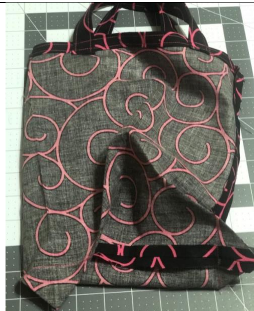
Image 19 Both corners are sewn and bag is ready to turn right side out.